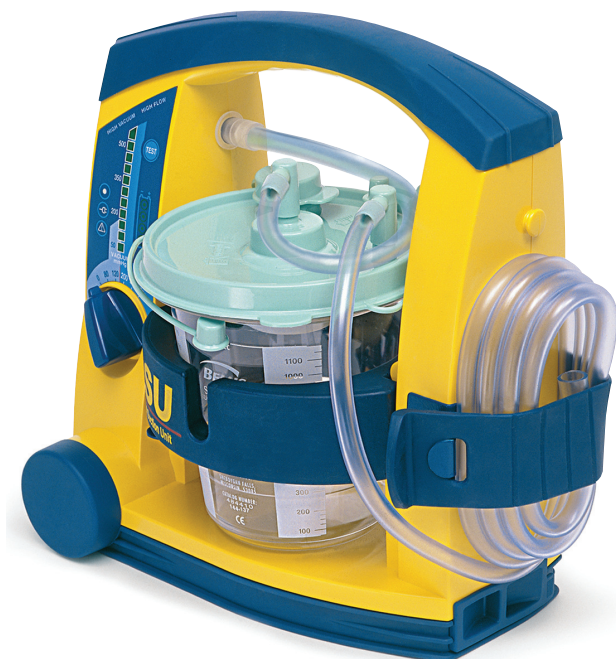
Figure 2 Portable suction unit.